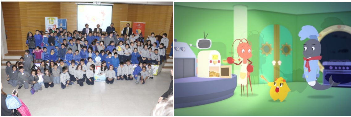
The series launch, September 9, 2016

During 2016, the chapters were completed, the series was officially launched at the Interactive Center for Arts, Sciences and Technology (CICAT) of the Universidad de Concepción. It was broadcast on channel 9 Biobío TV, achieving a reach of 25,000 to 30,000 viewers per chapter. With a total of 300 thousand spectators for the series. The series also has an interactive video game application: where students are motivated to answer scientific questions associated with the school curriculum. This videogame is divided by the different courses of first cycle of Basic Education. See the website www.tonytonina.cl and the associated YouTube channel.